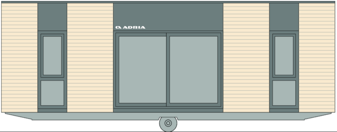
MLine 905 B22