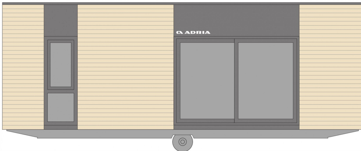
MLine 854 F22