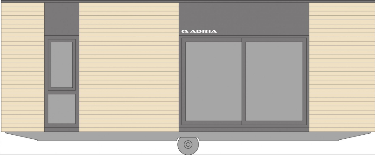
MLine 854 F22