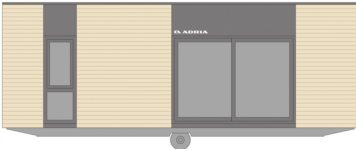
MLine 854 F22