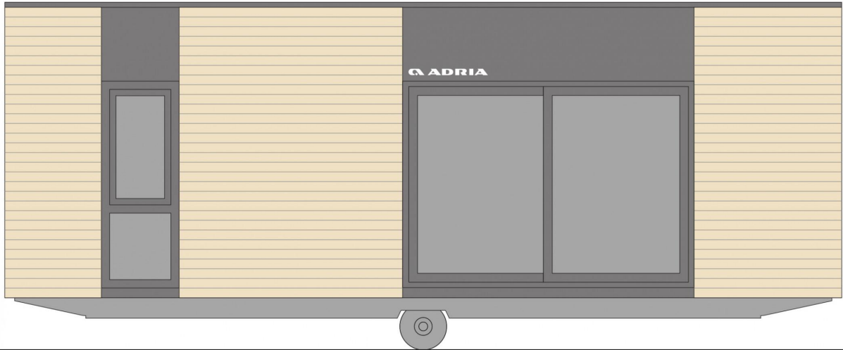
MLine 854 F22