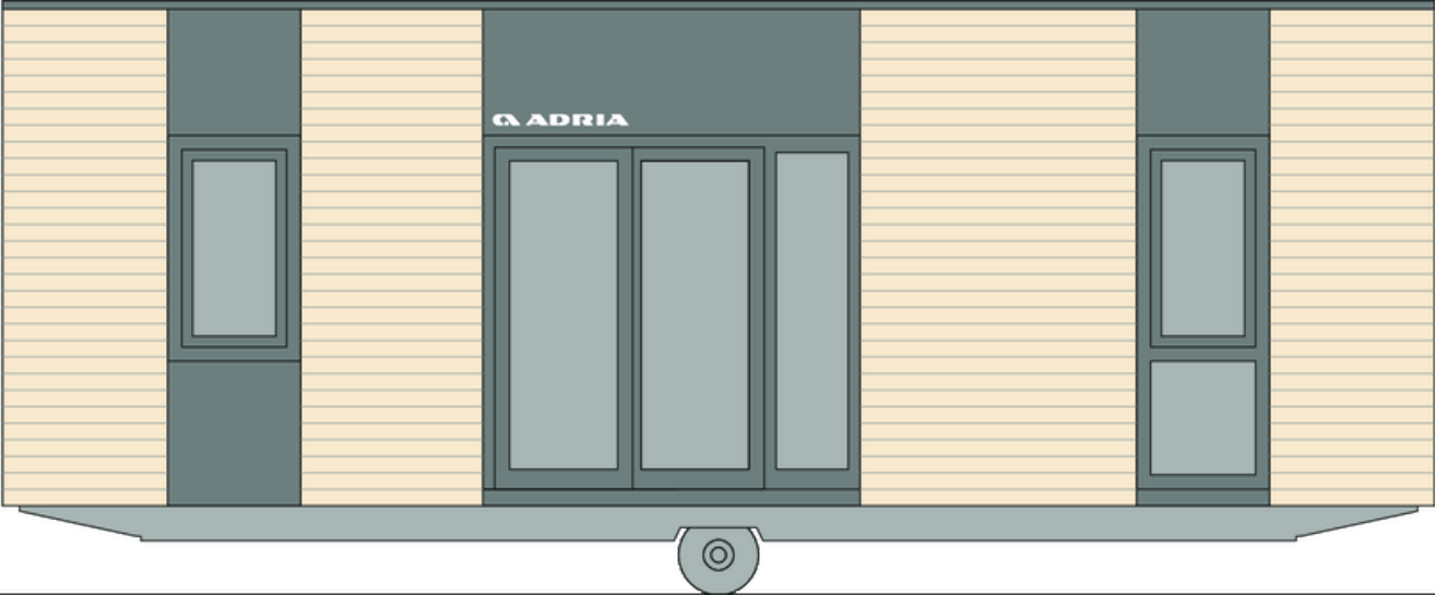
MLine 854 B32