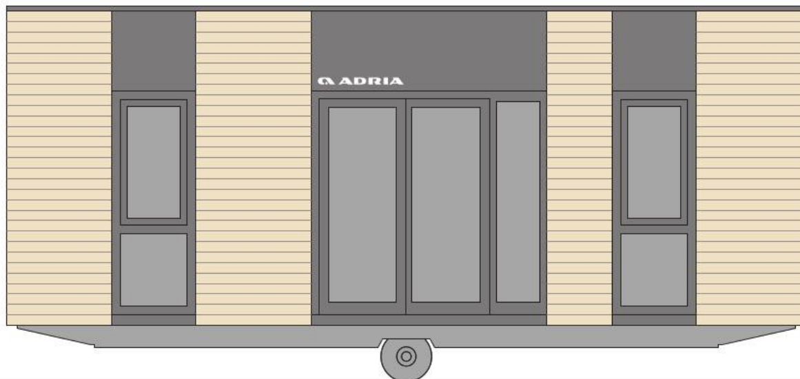
MLine 754 B22