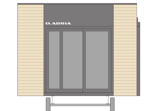
MLine 504 H11