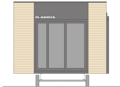
MLine 504 H11