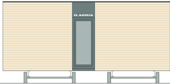
Aurora Twin 907