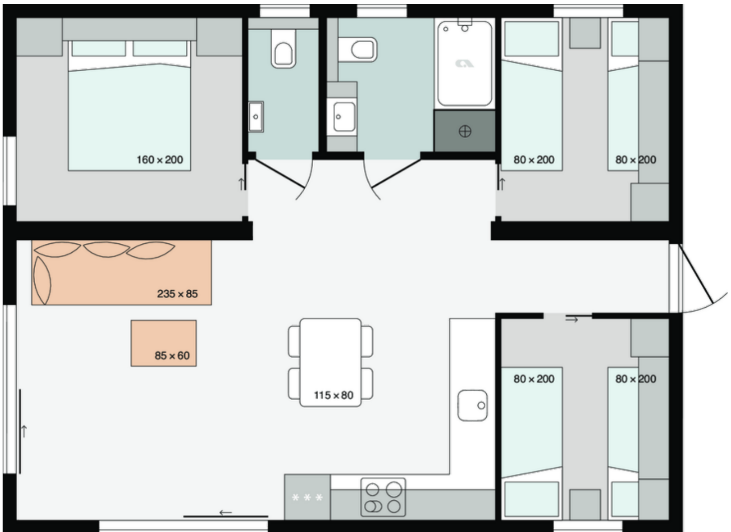
Aurora Twin 907