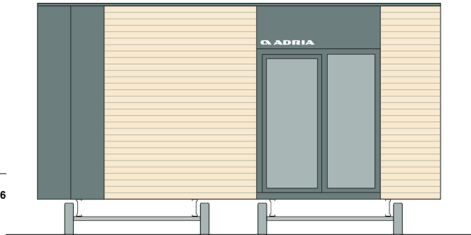
Aurora Twin 856